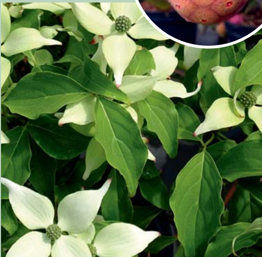
Cornus kousa 'Robert Select' (kl. Bild Frucht)