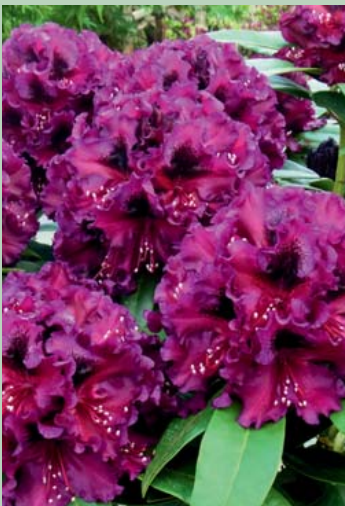
Dramatic Dark® EU