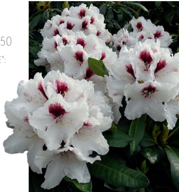
Hachmann's Picobello® EU

Over 100 varieties on lime-tolerant roots (Easydendron® by INKARHO®).