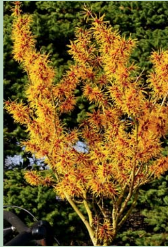
Hamamelis 'Golden Grace'®