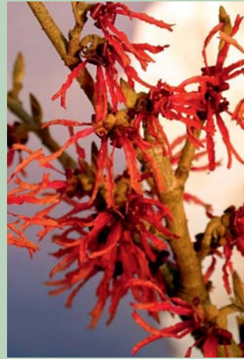
Hamamelis 'Scarlet Grace'