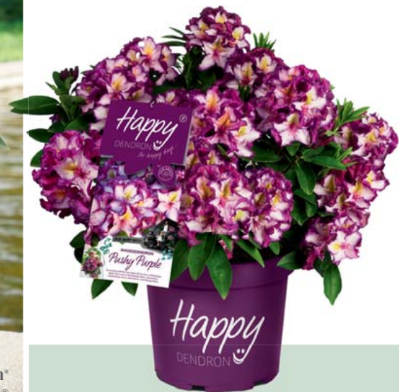
Happydendron® 'Pushy Purple'