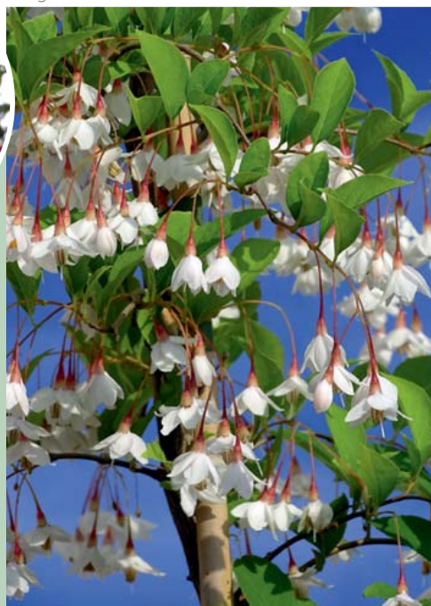
Styrax japonica 'Pendula'