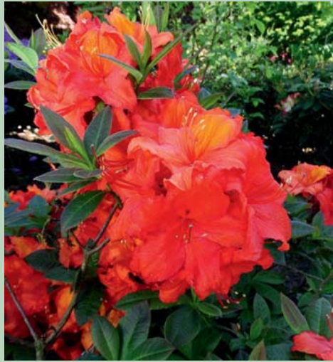
Rh. luteum 'Aprikot'