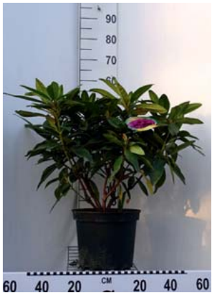
Rhododendron Hybr. Dramatic Dark® C7.5 40-50 cm

From Flensburg / Kiel A7 Exit 18 Kaltenkirchen turn right → Lentförden/Elmshorn In Lentförden turn left (B 4) Hamburg/Elmshorn, approx. 9 km after railway tracks Turn right at the traffic lights → Elmshorn/Barmstedt From Hamburg A23 Exit 13 → Horst/Elmshorn Turn right onto L288 → Wrist/Barmstedt/ Brande-Hörnerkirchen/ Groß Oftenseth-Aspern In Groß Oftenseth-Aspern Turn right onto main road L112 → Brunnenstraße 68, Barmstedt