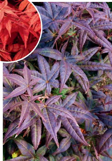
'Rhode Island Red'