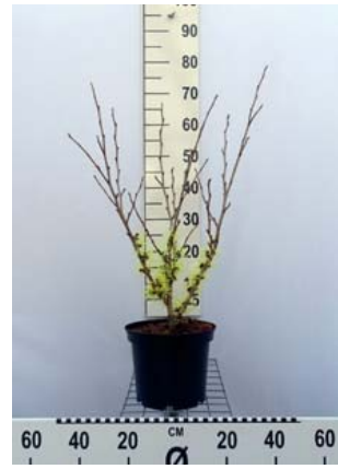
Hamamelis intermedia 'Angelly' C5 40-60 cm