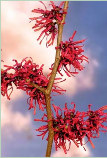
Hamamelis 'Red Grace'