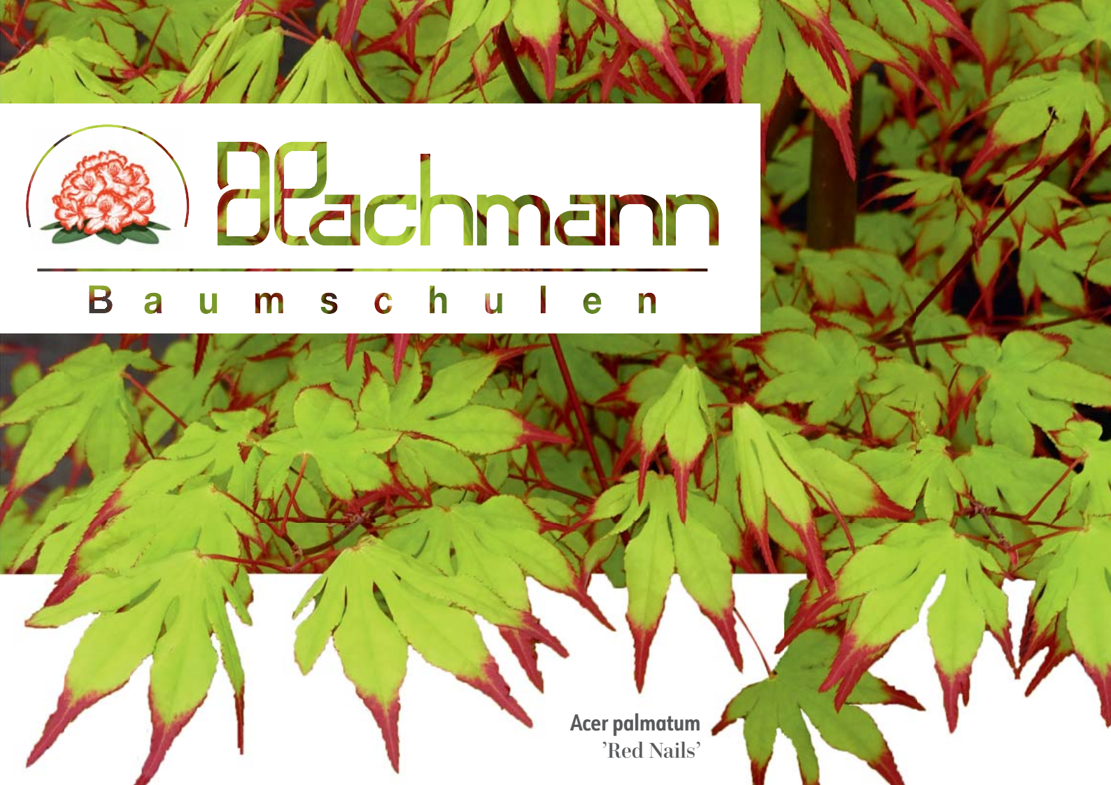
Acer palmatum 'Red Nails'