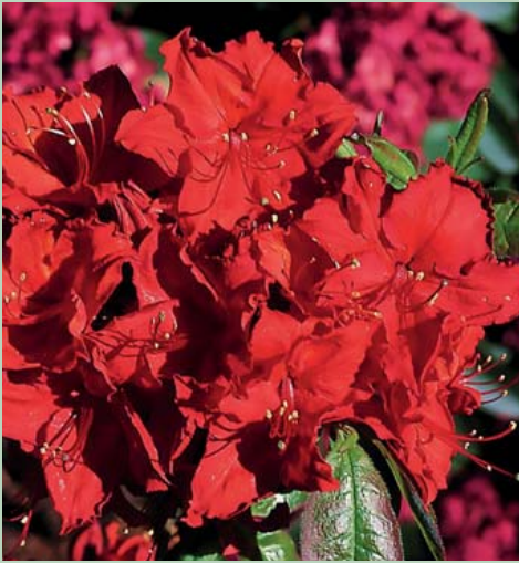
Rh. luteum 'Doloroso'