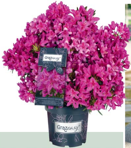
Grazeasy® Dark Pink®