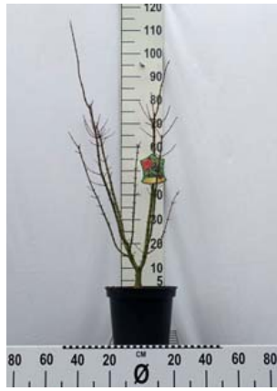
Acer palmatum 'Cristatum' C7.5 80-100 cm