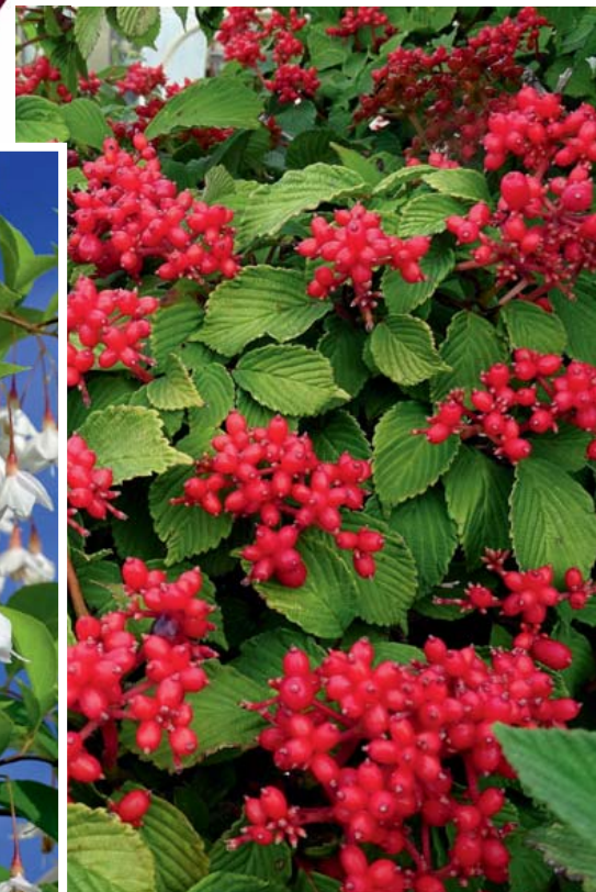
Viburnum plicatum 'Pink Beauty'