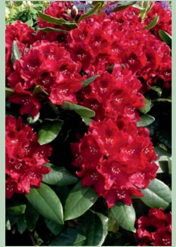
Cherry Kiss® EU