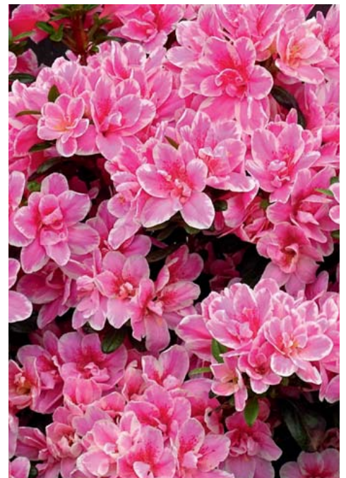
Rh. obtusum Pink Poetry ® EU

overwhelming abundance of flowers neither evergreen nor deciduous= wintergreen! particularly pruning tolerant