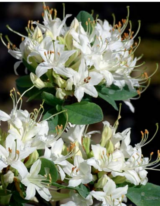
Rh. atlanticum 'Snowbird'