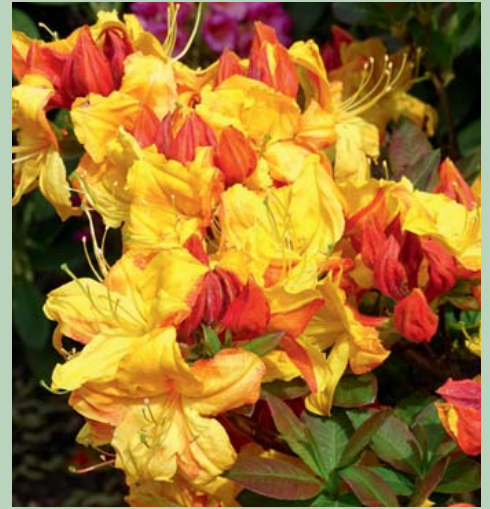
Rh. luteum 'Golden Nectarine'