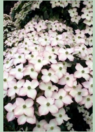
Cornus kousa 'Cappuccino'